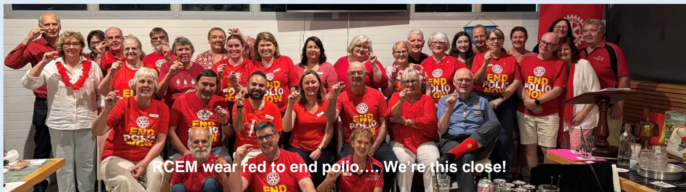
RCEM wear red to end polio.... We're this close!