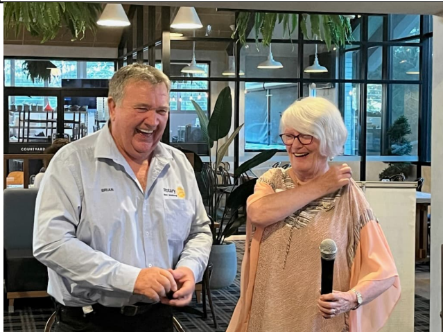
Donating to the Foundation is fun!