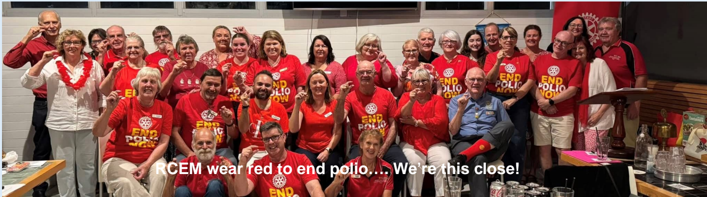
RCEM wear red to end polio... We're this close!