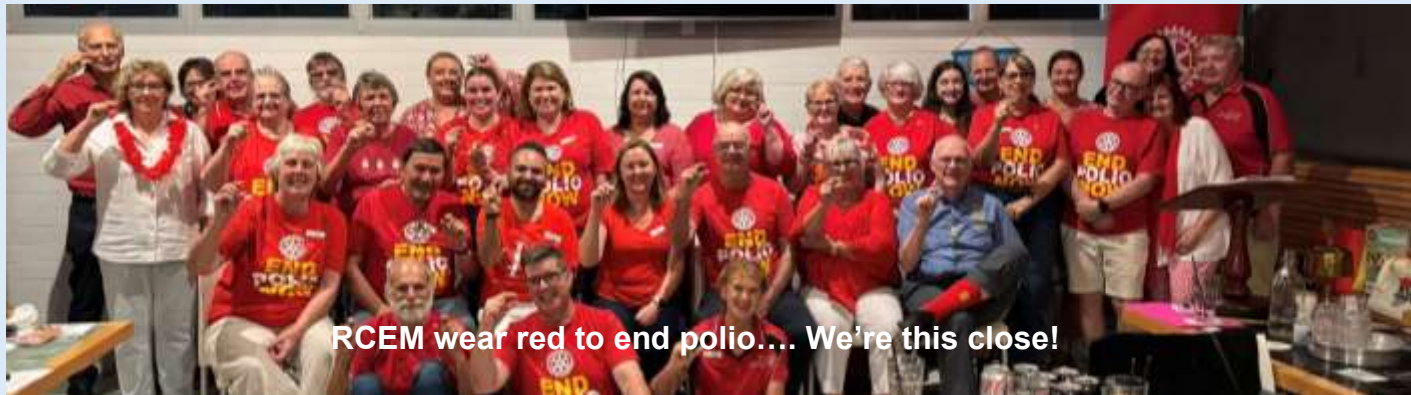
RCEM wear red to end polio.... We're this close!