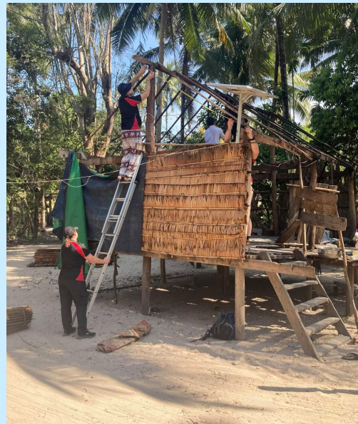
House Repairs in Cambodia