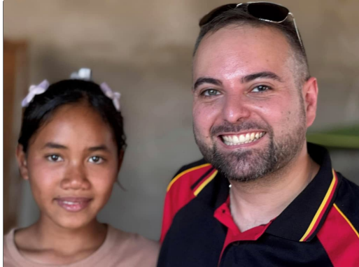
SIM's Cambodia 2025