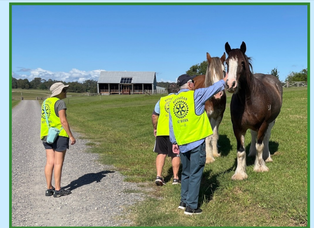
Wednesday Walking Group's visit to Tocal