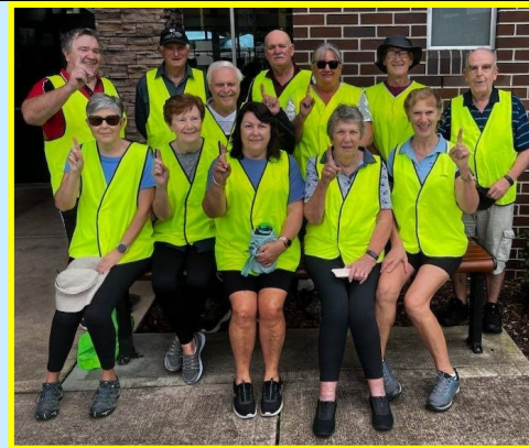
Participants in the '12 Months Walk'

Tuesday's Team from the 8 RCEM members who have volunteered at the Science and Engineering Challenge at University of Newcastle during the past week.