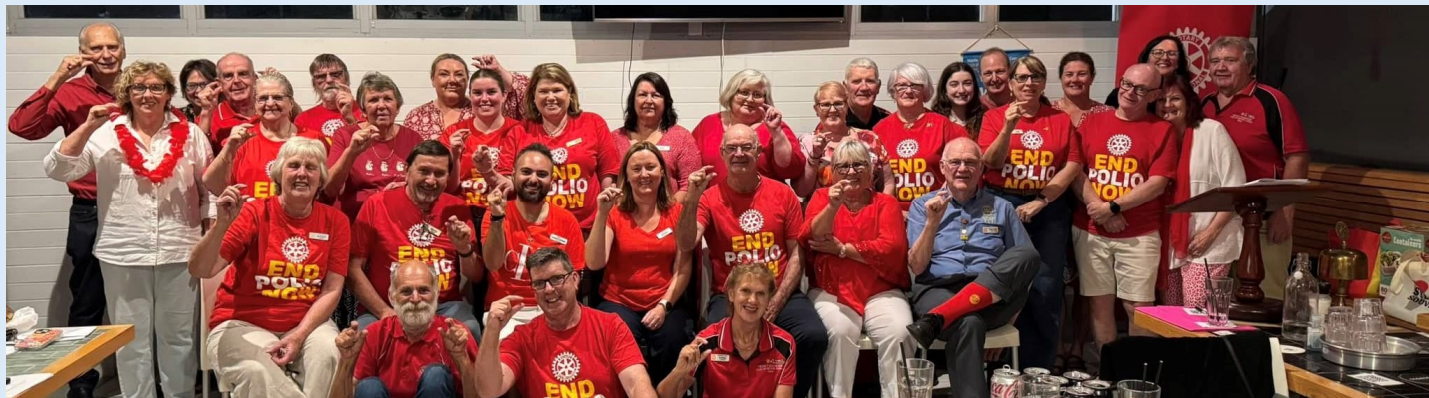
RCEM wear red to end polio