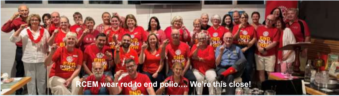
RCEM wear red to end polio.... We're this close!