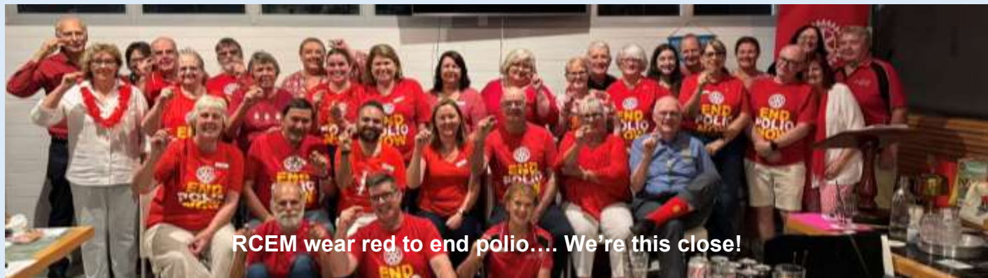
RCEM wear red to end polio.... We're this close!